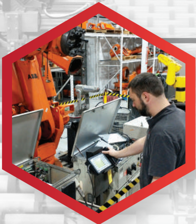
ABB · Fanuc · Kuka · Motoman